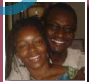
By Sandra & Robert Walker

Perhaps young people in today's church face more pressure than previous generations regarding building meaningful relationships and engaging in respectful courtships. The following article looks at a couple of scenarios and offers young people some help and guidance to avoid pitfalls of immorality, and so establish relationships that honour Yahweh.